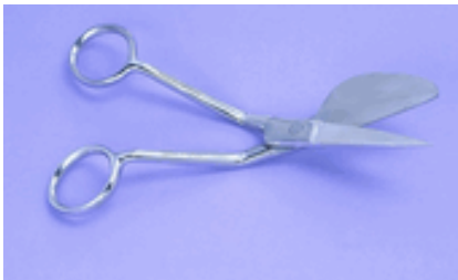
Improved Left Hand Pelican Scissors