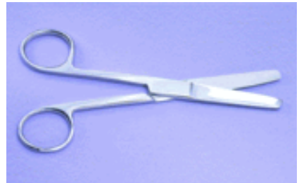
Left Hand Straight Fabric and Lace Trimming Scissors