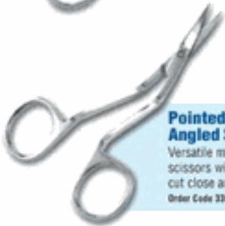
Pointed Tip Multi-Angled Scissors Versatile multi-angled scissors with pointed tips cut close and clean. 4". Order Code 33038