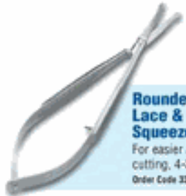
Rounded Tip Lace & Applique Squeeze Scissors For easier and safer cutting. 4-3/4". Order Code 33013