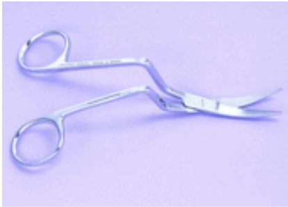
Left Hand "Ultimate" Embroidery Scissors