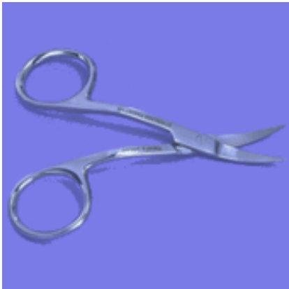
Left Hand Double Curved Scissors