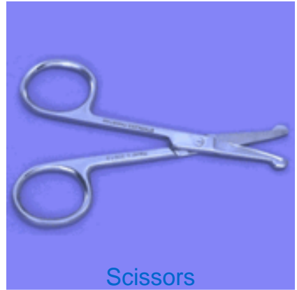
Scissors Left Hand Lace and Applique