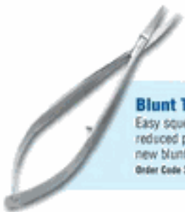
Blunt Tip Snip-Eze Easy squeeze cutting and reduced poke through with new blunt tips. 4-3/4". Order Code 33012