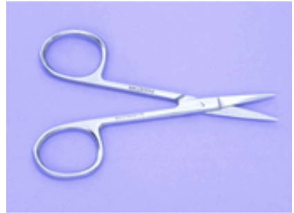
Left Hand 3 1/2" Embroidery Scissors