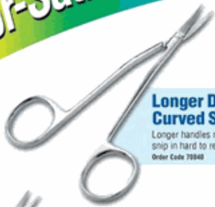
Longer Double Curved Scissors Longer handles make it easy to snip in hard to reach places. 5". Order Code 70040