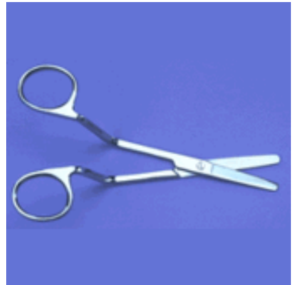
Double Curved Left Hand Applique Scissors