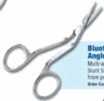
Blunt Tip Multi-Angled Scissors Multi-angled scissors with blunt tips protect fabric from pokes and tears. 4". Order Code 33037