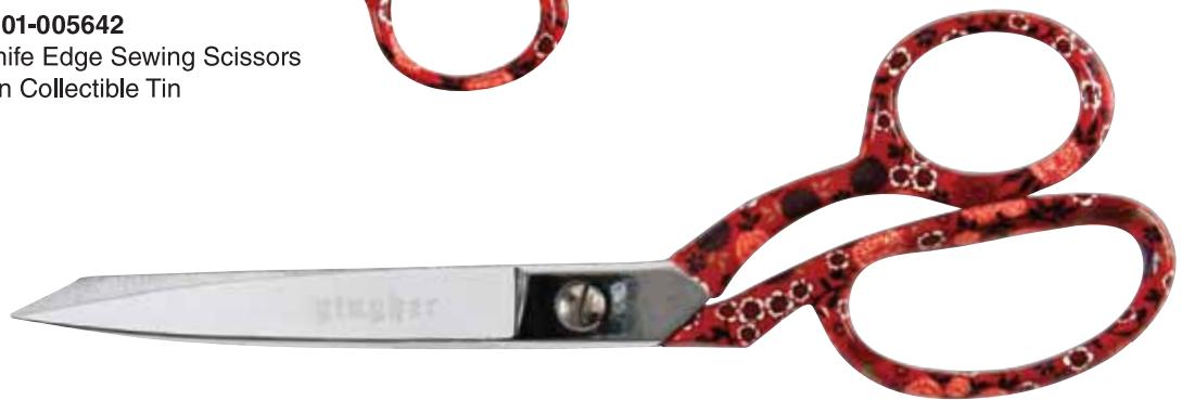
Model No. 01-005639 Sonia 8" Knife Edge Dressmaker's Shears Packaged in Collectible Tin